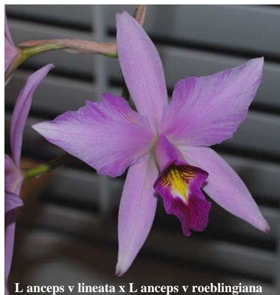
L anceps v lineata x L anceps v roeblingiana